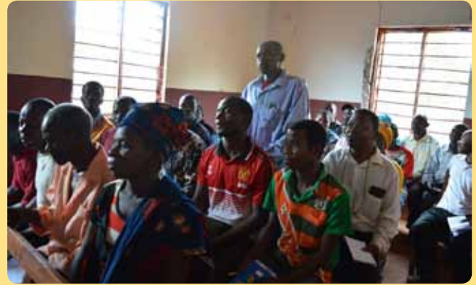
Participants following the legal and land access rights training prepared by MVIWATA

In a country where almost 80% of its population rely on agriculture for their livelihood, knowledge on policy and laws governing land use deserves paramount attention in national planning.