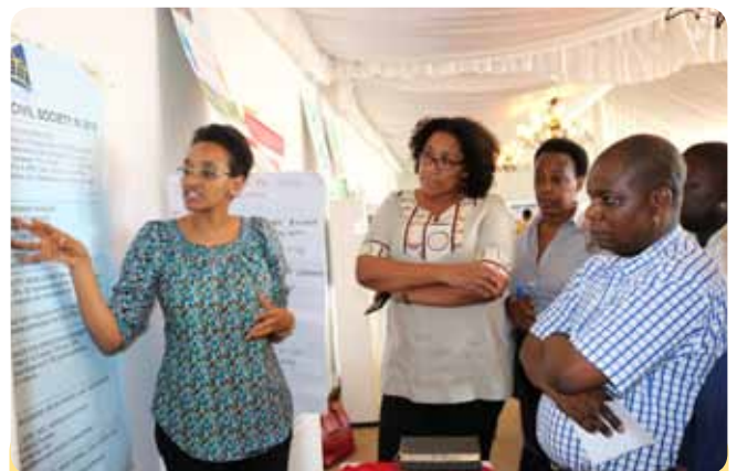
The FCS Head of Business Development and Partnership briefs participants on FCS key success message & challenge on gender intervention from FCS grantees for the year 2016.