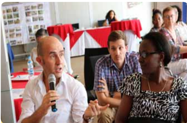
A BBC representative speaks during the event.