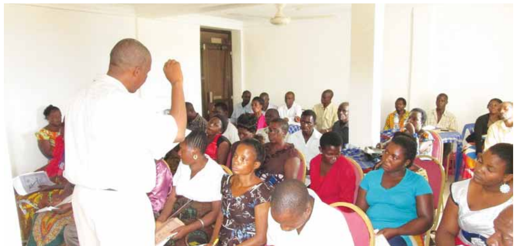
A facilitator trains Youth on the importance of forming their Youth forums. This event took place in Mbeya and was organized by MHNT