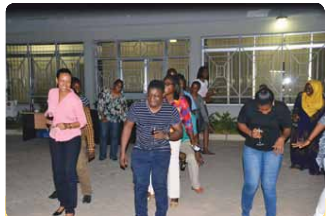
Special Kwaito dance performed by FCS staffs during the event