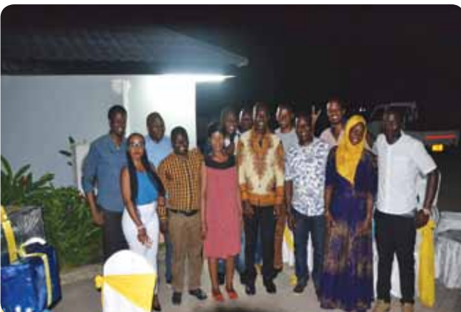
Group photo for some FCS staffs and the Outgoing ones