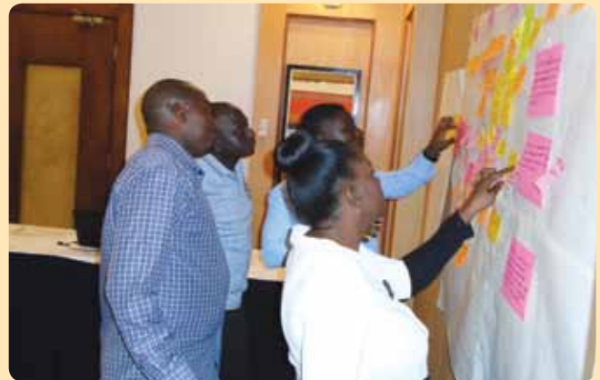
FCS Board Members, Development Partners, Management Team and Grantees attending a workshop at Ledger plaza, Bahari Beach Hotel in Dar es Salaam earlier this year. The workshop revised the FCS Theory of Change. Below is the summary representation of the FCS revised Theory of Change with its pathways.